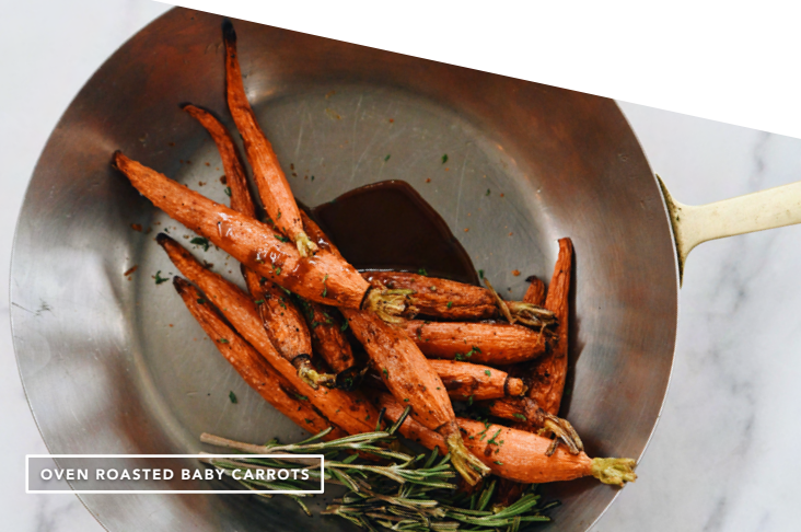
OVEN ROASTED BABY CARROTS

Green Bean Casserole french green beans, cream of mushroom, crispy onions