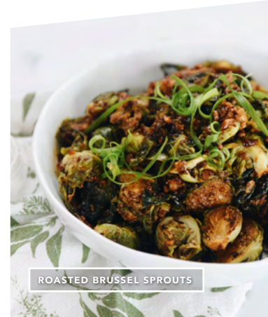
ROASTED BRUSSEL SPROUTS