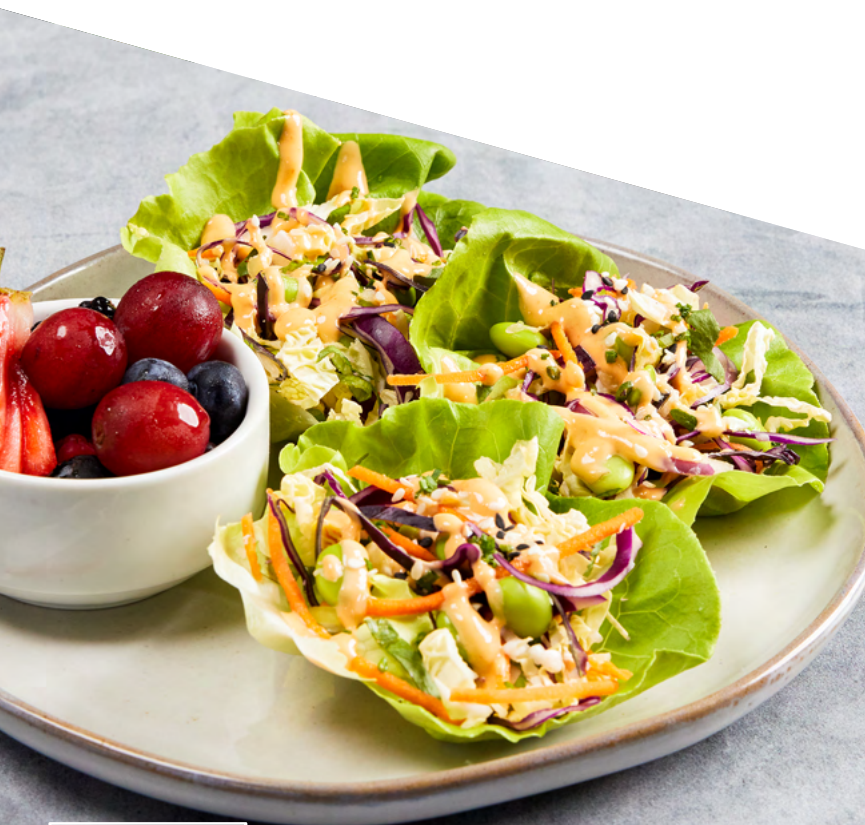
ASIAN LETTUCE WRAP

*No cookie substitution on individual box lunches.