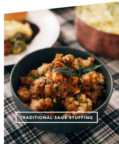
TRADITIONAL SAGE STUFFING