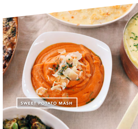
SWEET POTATO MASH