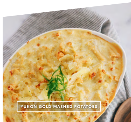
YUKON GOLD MASHED POTATOES