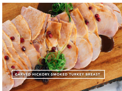
CARVED HICKORY SMOKED TURKEY BREAST