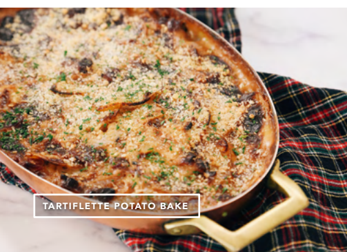
TARTIFLETTE POTATO BAKE