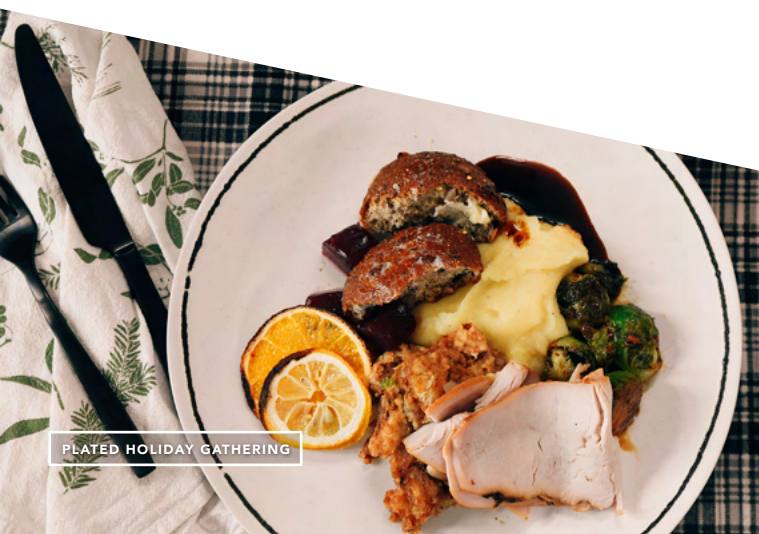
PLATED HOLIDAY GATHERING

Apple Strudel Bourbon Pecan Pie Cherry Pie Belgian Chocolate Mousse Pie Pumpkin Pie